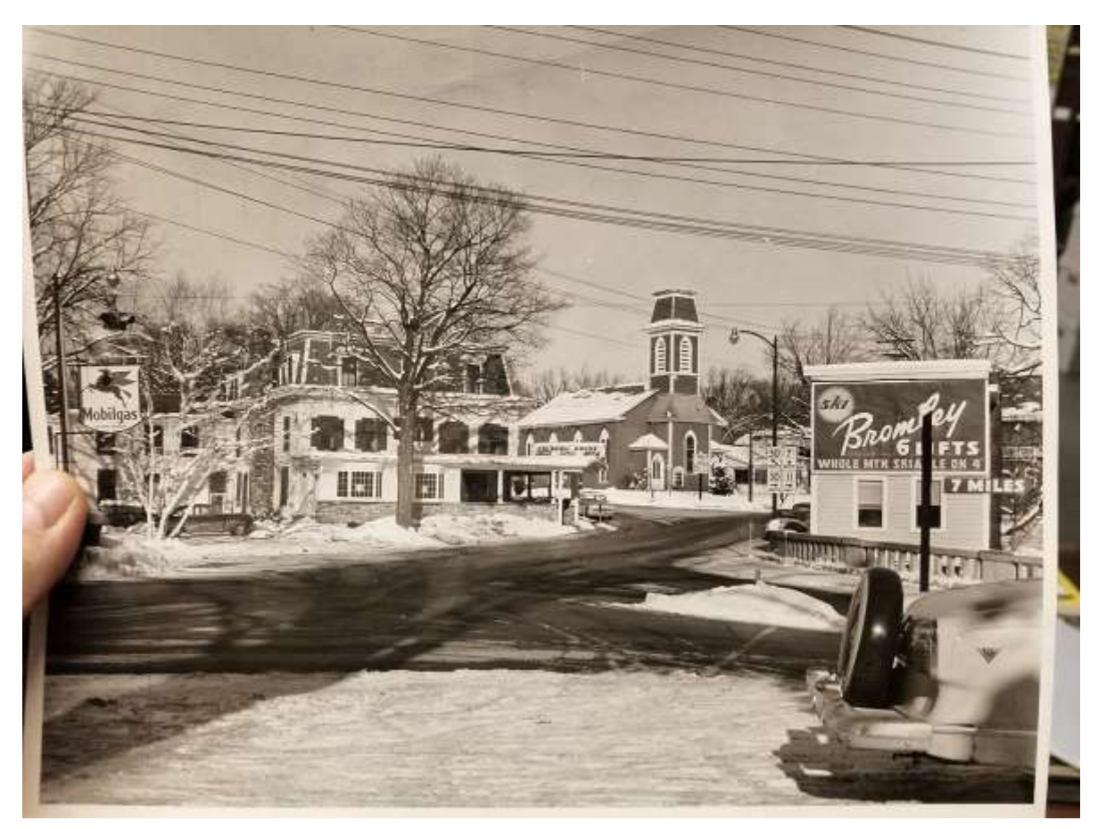
Photo from the 1970s.